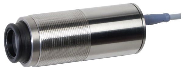
Polaris Infrared switch in stainless steel housing